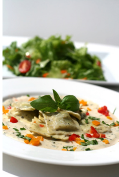
Caramelized Pear and Gorgonzola Ravioli in Basil Cream Sauce.

We also took the Butternut Squash Ravioli for a ride as dessert, with a sauce of beurre noisette and maple syrup , topped with candied walnuts (try hazelnuts if you prefer) and a generous dollop of crème fraîche (the slight tartness of crème fraîche works far better than unsweetened whipped cream). You can also add dried fruits—raisins, dates and figs are a sophisticated touch. Both recipes were magnificent—just not in the same meal!