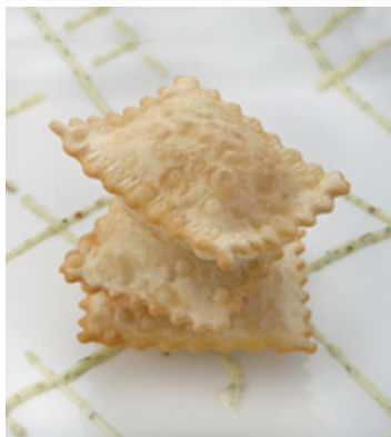
Looking at pasta a different way: Butternut squash ravioli are fried and served with a piping of Basil Cream Sauce.

Home Table Of Contents Top Pick Of The Week Product Reviews Marketplace Food Fun Home Zone